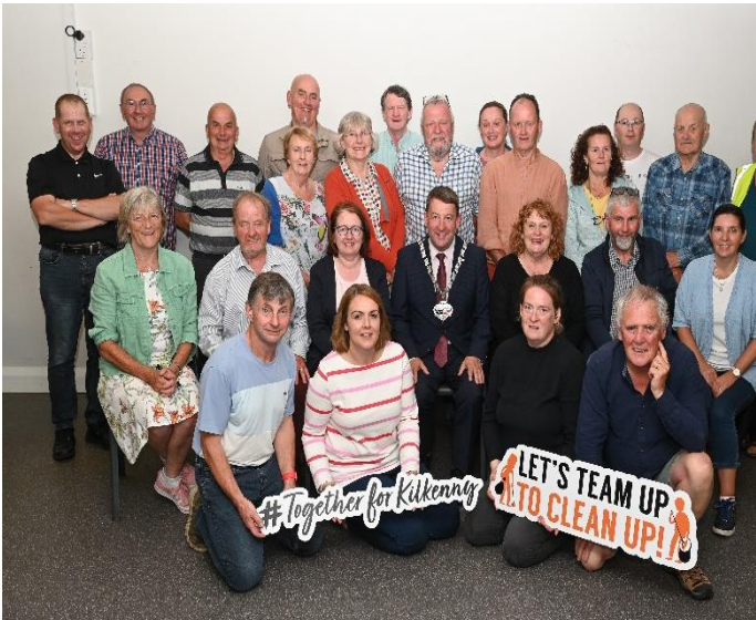
Tidy Towns Forum in Ballyragget