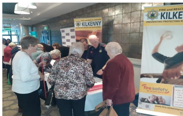
Fire Personnel giving fire safety advice at the Kilkenny Older People's Council celebration in the Kilkenny Ormonde Hotel.

Stations despite the inclement weather conditions.